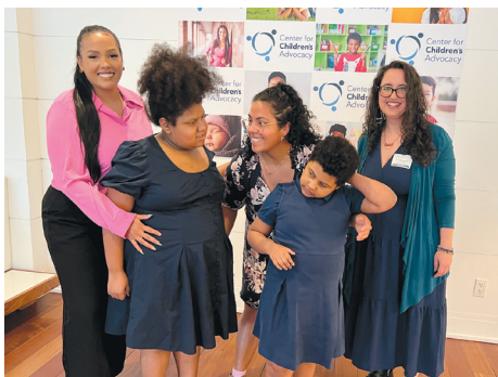
Family sharing their voices from CCA's Educational Success Project