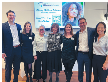
Dream Team who worked on the habeas cases from CCA's Immigrant Children's Justice Project